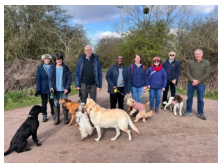
(Walking in fellowship with our four-legged friends)

A Huge Thank You to all the regulars and New Faces who joined us for our third Monthly Connect Groups Dog Walk last Saturday at the Marston Forest Centre. The weather was dry, the skies blue and a great time was had by all, including the dogs!