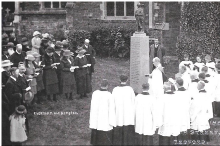
Eversholt Remembrance Service 1927

On June 18 th last year the bronze cast statue of St Michael, that had stood on the marble War Memorial column in Eversholt church yard since the 1920s, was stolen. Eversholt, and St John's Church, had lost an iconic symbol that had been a presence for 100 years, and many felt a deep emotional loss. This was coupled with a sense of outrage that the sacrifices of Eversholt residents in two World Wars had been belittled by an act of material greed and selfish opportunism.